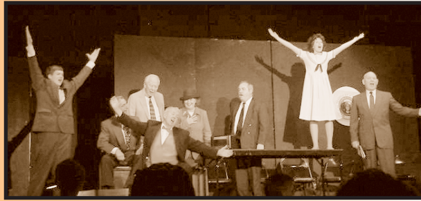
Three cheers for the Soo Theatre Project!