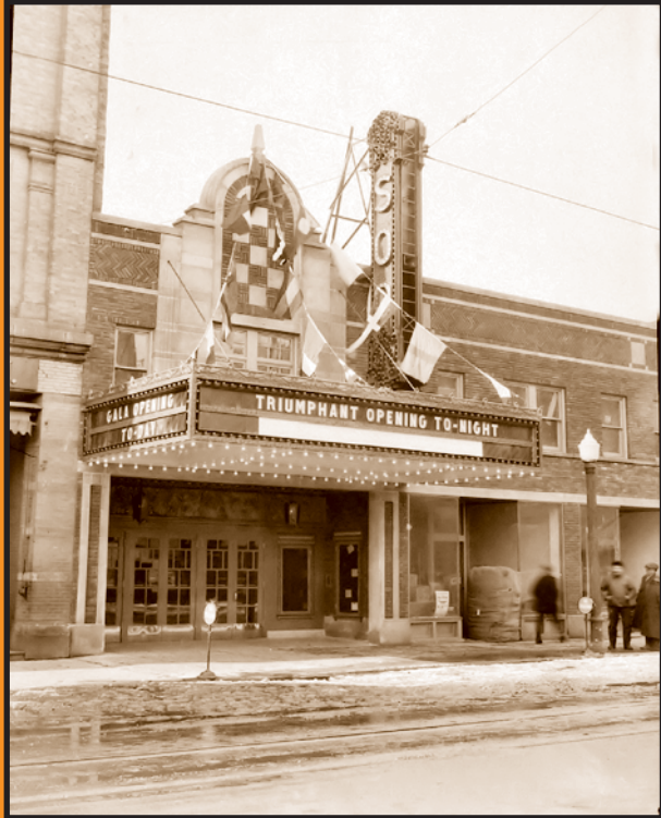
Soo Theatre 1930

We love to dance! Please help us move the dance room upstairs where there is plenty of room for us to tap, pirouette, swing, salsa, and enjoy the freedom of artistic movement.